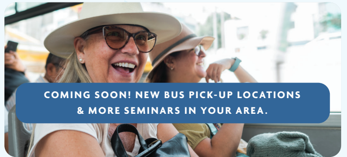
COMING SOON! NEW BUS PICK-UP LOCATIONS & MORE SEMINARS IN YOUR AREA.