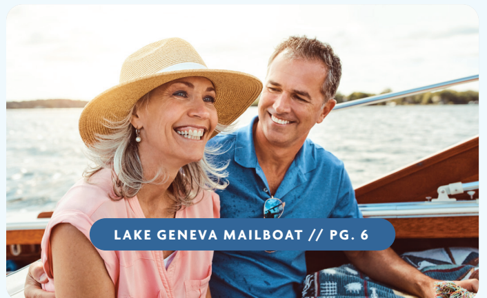
LAKE GENEVA MAILBOAT // PG. 6